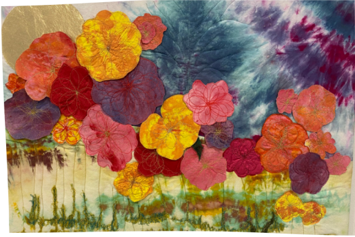
Sandy Tanner Ethereal Thread