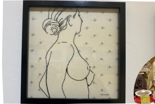
Deborah Sementelli Gesture in Thread