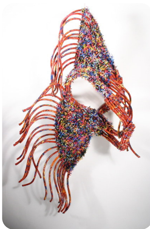
Swimming , Passle Helminski