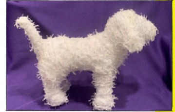
White Dog, Passle Helminski

Woven on an eight harness loom with a silk warp and alpaca weft