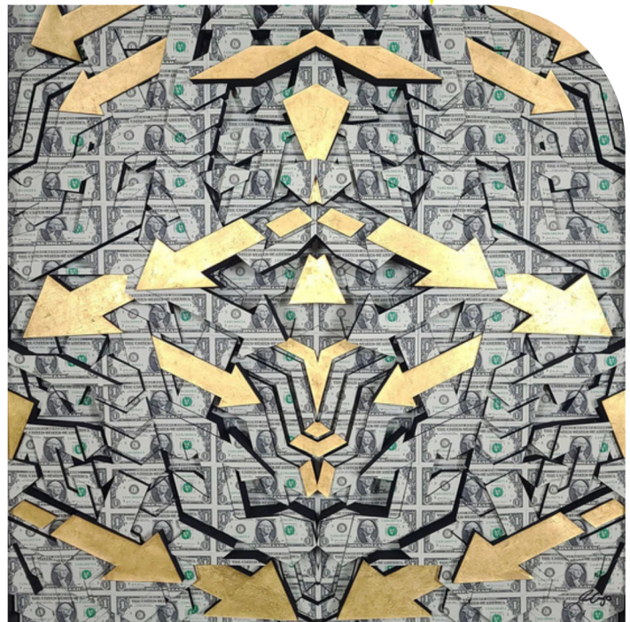
Substance 1 Layers of US dollar bills, gold leaf & 24K gold, framed