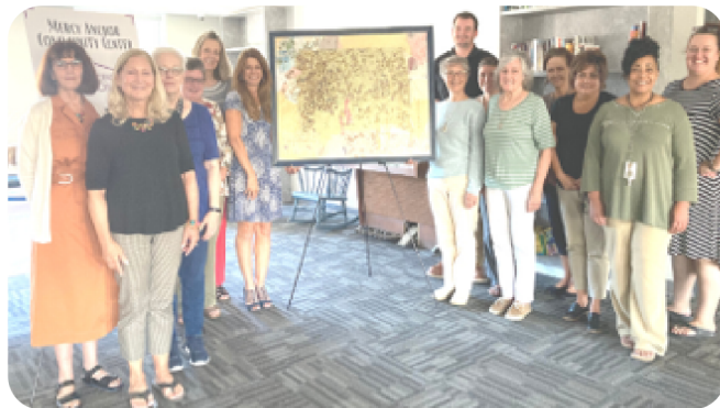
Art donated to the Mercy Community Anchor Center